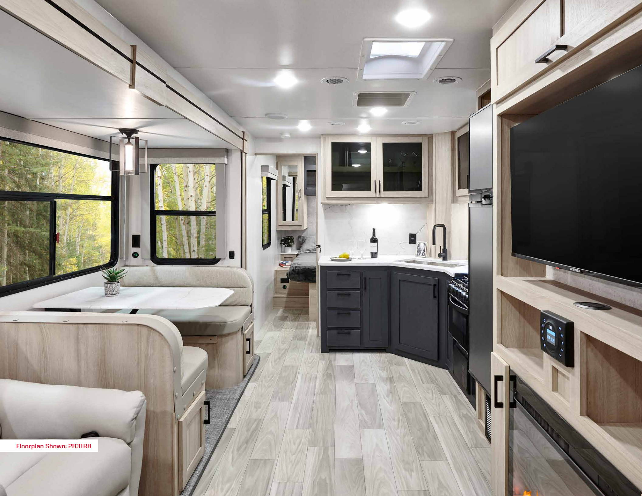
Floorplan Shown: 2831RB